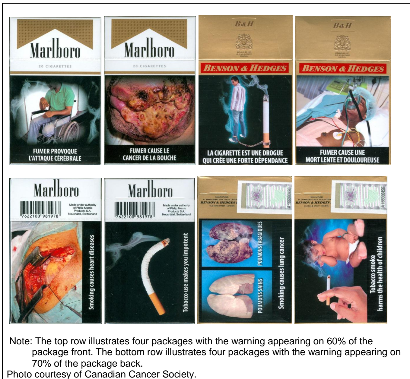
Figure 3. Set of eight cigarette picture warnings in Mauritius