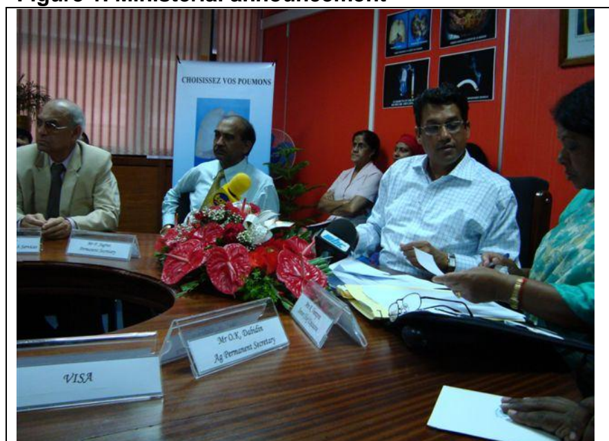
Figure 1. Ministerial announcement

Mauritius Minister of Health and Quality of Life, Dr Rajesh Jeetah (centre right), 12 February 2009, announcing the new picture warnings.