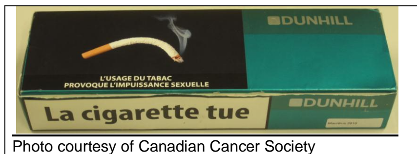
Figure 4. Cigarette carton

The cigarette health warning requirements also apply to cigarette cartons. Thus a picture warning appears on 60% of the front principal display area in French, and 70% of the back principal display area in English. The text message “Smoking kills” appears on 65% of two other carton sides, once in French, and once in English. Figure 4 illustrates a cigarette carton.