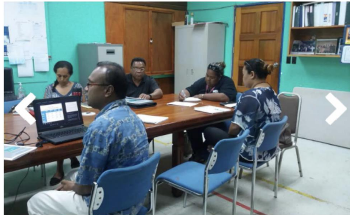
Some members of Palau's Tobacco Control Working Group

The Parties to the WHO FCTC and – for the first time since the entry into force of the Protocol – the Protocol Parties are now expected to complete and submit their implementation reports.